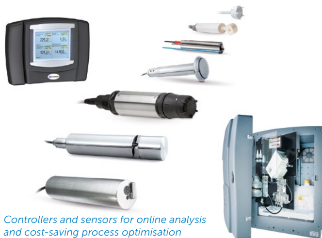
Controllers and sensors for online analysis and cost-saving process optimisation