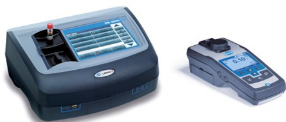
Benchtop and portable instruments for lab analysis Inspection, maintenance and equipment qualification services available

* For additional parameters and solutions please contact your local Hach representative or visit our website.